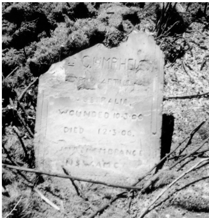
Figure 4: Grave Marker B. The legible engraved particulars on Grave Marker B are: 'C Umphelby, Artillery, Australia, Wounded 10.3.00, Died 12.3.00, In remembrance, NSWAMC, T 15'. Photo by author, 8 December 1996.

The second tombstone belonged to Sgt Franklin of the Essex Regiment and is identical to Umphelby's stone. The third unmarked individual grave might be that of Lt Wimberley of the Welch Regiment who died on the same day as Umphelby, although positive identification has proved impossible. 29 The mass graves of the other ranks buried here are indicated by two burial mounds of packed rock, each located to either side of Umphelby, Franklin and the third unmarked grave. The mass graves have no markers. The original four corner fence-posts of the cemetery still stood, and some rusted barbed wire which once enclosed the graves I found amongst the scrub. At that time, however, it was impossible, due to the dense vegetation, to undertake an accurate appraisal of the surface evidence.