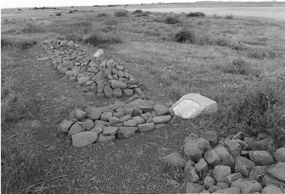
Figure 5: Driefontein Field Hospital cemetery, 10 March 2000; Lt Col Umphelby's grave in the foreground and Sgt Franklin's grave further to its left. The rock mounds cover mass graves of British hospital fatalities.