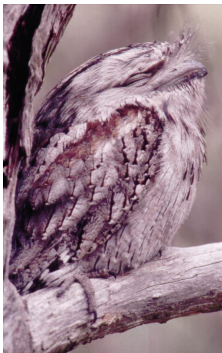
Figure 1 Tawny frogmouth ( Podargus strigoides ).

Small endothermic birds and mammals have enormous food requirements because of the fast metabolic rate that is necessary to regulate a high body temperature ( T_b ). When this high metabolic rate is unsustainable, for example in periods of adverse weather and/or food shortage, many small mammals (body mass 2–10,000 g) survive by entering a state of torpor 1–3 . The study of torpor in birds has so far been restricted to species weighing less than 80 g (refs 2,4,5), and rather than using torpor to overcome